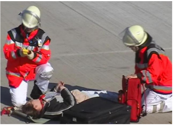
Figure 6. Physician triage. An emergency physician (rightmost) examines a casualty. He is assisted by three paramedics: the first (f.r.t.l.) writes the physician's diagnosis and triage status down on a triage tag; the second checks the blood pressure; the third lists the triage status of each examined casualty for an overview.