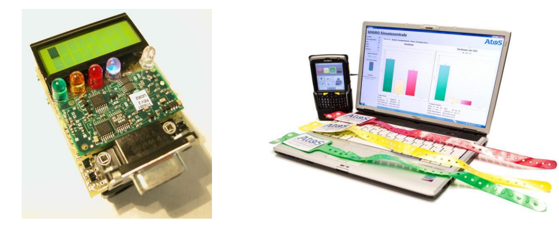
Figure 4. Electronic triage tag with colour LED technology. Photo see Gao et al 2007: 207.

Figure 3. German Red Cross triage tag (2012) with a foldable multicoloured piece of paper.