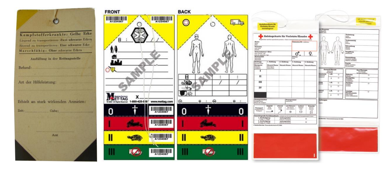
Figure 1. Military triage tag with three tear-off corners; Germany 1938.

Figure 2. Since the 1970s the popular METTAG uses a three-tiered system. In the last decade a barcode was added to the tag.