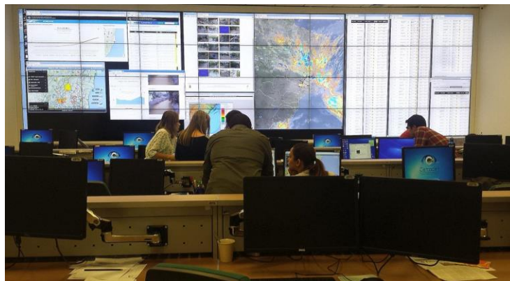
Figure 1. The Monitoring Room

Although CEMADEN has its own monitoring equipment (including hydrology stations, meteorological stations, and automated rainfall gauges), the center works in collaboration with several institutions such as the National Water Agency (ANA), the Brazilian Geological Research Company (CPRM), and the National Institute of Meteorology (INMET). These provide further data about weather conditions, risk maps, and environmental variables, which thus supplement the existing data of the center. All these data can thus be made available to support the monitoring activities and warning services carried out inside a Monitoring Room (Figure 1).