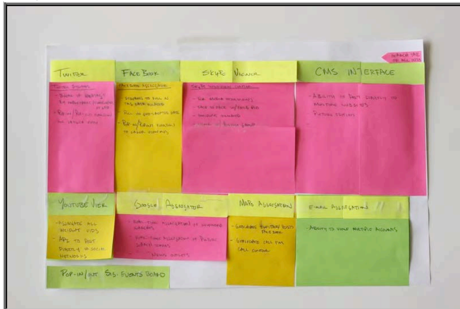
Figure 3: PIO Information Space PICTIVE Prototype