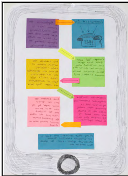
Figure 5: PIO Prototype Designed to Look Like a Mobile Phone

between sites to perform all their tasks. This need for mobile support appeared in the prototyping sessions; several PIOs created prototype designs for their mobile phone (see Figure 5).