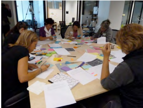
Figure 2: PIO Participants Creating PICTIVE Prototypes

Following the group discussion was an individual design session using the PICTIVE 2 method (Muller, 1992; Muller, Tudor, Wildman, White, Root, Dayton, Carr, Diekmann and Dykstra-Erickson, 1995). PICTIVE is a participatory design method where users build low-fidelity prototypes; participants construct their prototypes with paper and other office supplies—pens, pencils, tape, scissors, markers, Post-Its, etc. Use of the PICTIVE method gave workshop PIOs an opportunity to apply insights from the group discussion and externalize their information needs through design artifacts. Further, the low-fidelity prototypes that the PIOs produced could be referred to and built upon during future prototyping and development research phases.