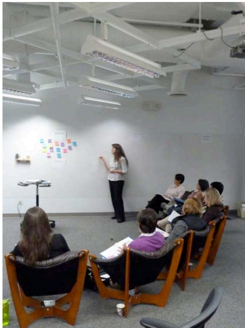
Figure 1: Group Discussion

In Particular, the research here employs a type of future workshop—a technique for gathering researchers and end-users (in this case PIOs) to collaboratively create new ideas and solutions in the context of a workshop. Originally developed for use in German civic planning, future workshops (Jungk and Mullert, 1987) give groups of citizens with limited resources a role in the decision-making process. Future workshops are typically composed of three parts: discussion of existing problems, envisioning the future, and making an action plan (Muller and Druin, 2012).