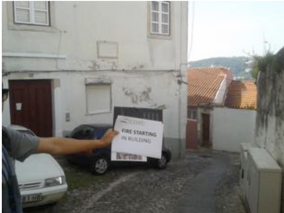
Figure 3. Assistant in the simulation exercise showing a poster that indicates an event supposed to be occurring