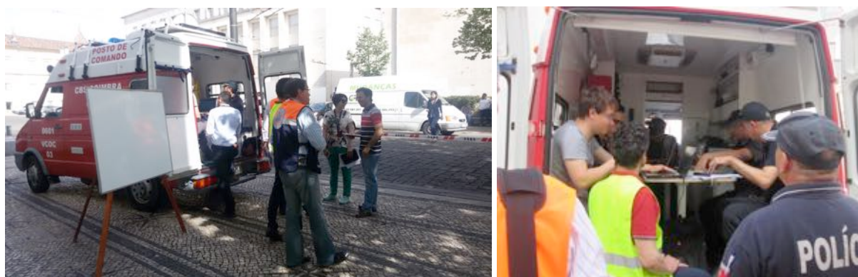
Figure 4. The site command centre

The alarm call was made at 10am (real time) through the European common emergency telephone number (112). The defined mechanisms to start the means of assistance were followed and the Professional Corporation of fire-fighters was contacted. Due to the seriousness of the occurrence, a site command centre (SCC) was set up for the control of all fire brigade operations (Figure 4). Such SCC consisted of a senior fire officer (who played the role of site commander), two fire-fighters (the site commander’s assistants), and three crowdsourced information operators (all three, training school participants) – two of them received and processed information reported by volunteers using the KoBo application and one operator dealt with the data collected with the Hydra application. The process of “information reception, information processing, and actions” was operated at SCC following a “triangular” structure illustrated in Figure 5.