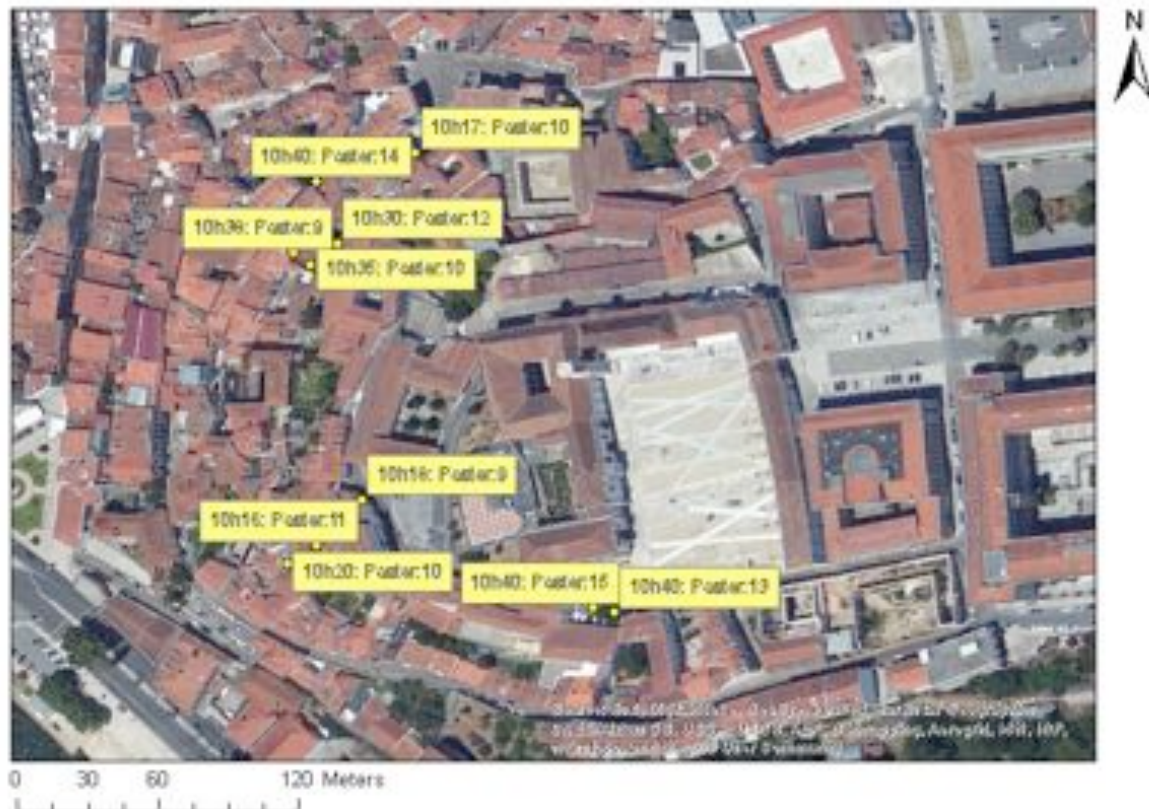
Figure 2. Example of map used by one group of volunteers

To organise the information that was supposed to be observed by each group of volunteers and then to be sent to the Civil Protection Authority, an orientation map (Figure 2) was given to student assistants. One assistant accompanied each group, with the indication of the route that each group should follow. Some spots were highlighted in the orientation map where particular events were supposed to be observed and also the time they should be reported. A numbered poster was supposed to be shown to the volunteers at a particular time and location, in order to simulate a real event. Figure 2 shows one of the maps used and Figure 3 a picture of an event indication that volunteers were supposed to report. Besides the events indicated in the posters, all groups were free to report whatever other events they may have observed and considered of interest.