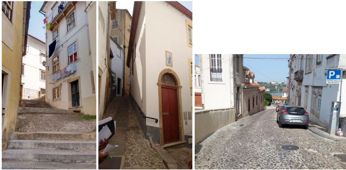
Figure 1. Images of the exercise location (the “Alta” neighbourhood in Coimbra)

Brigades, two police forces, namely the Police for Public Security (PSP) and the Municipal Police, and the safety office of UC.