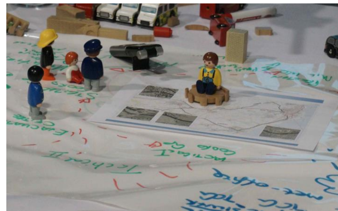
Figure 2. Pivotal information captured in photographs taken from army helicopter.

One expert brought a printout of a map with superimposed photographs taken from an army helicopter during floods with continued heavy rain, capturing significant infrastructure breakdown (Figure 2). He brought the map, because it had been pivotal for decisions about food distribution and emergency bridge