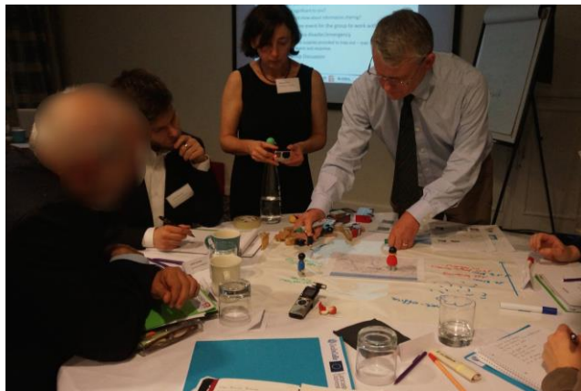
Figure 1. Re-enacting past disaster events

The workshop methods were designed around disaster re-enactments (past and future) in small groups (Figure 1). To ground these re-enactments in concrete experiences, each expert was asked to bring an object that was representative to them of a significant moment regarding interoperability during a disaster. As some of the key moments were re-enacted, focusing on crisis response efforts, particular emphasis was made on demonstrating practices and difficulties in information sharing and making sense of information. Then, after being introduced to our present design ideas and prototypes, we asked them to revisit their re-enacted scenarios and appropriate all of these prototypes. The experts were invited to re-enact the cases as if they already had these technologies and to make three-five minute video prototypes (Mackay & Fayard, 1999) that demonstrated how technology and new ways of working could come together fruitfully. Within and between activities was much time for open discussion. The activities, design results, and aimed for elicited ELSI are listed in Table 1. In the subsections below we explore key ELS themes that materialized.