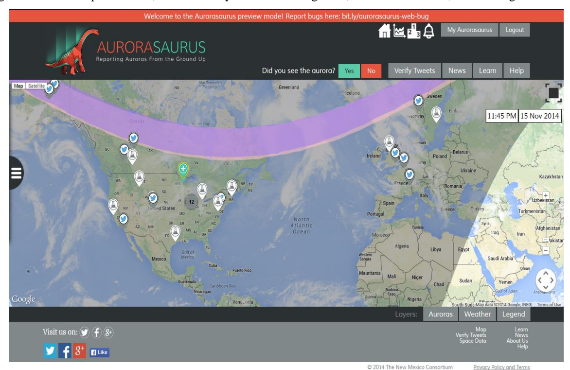
Figure 1 - Aurorasaurus Homepage.

Predicting when and from where the aurora can be seen is a non-trivial task. Space weather scientists use a suite of different methods to try to predict when the aurora might be seen (e.g. Newell, 2009; Sigernes, 2012). The strength of an aurora, and thus its location, is driven by the Sun's activity and the conditions in interplanetary space. In addition to driving the aurora, it is well known that space weather can have a strong, damaging, effect on both space- and ground-based technologies (e.g. NERC, 2012). While predicting when these space weather dangers might occur is an important task; we focus only on the less dangerous, but more beautiful, northern lights.