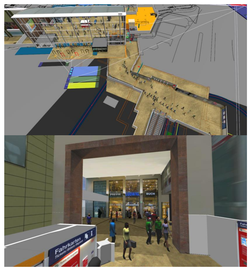
Figure 2: Two screenshots of the simulation of the Cologne central station