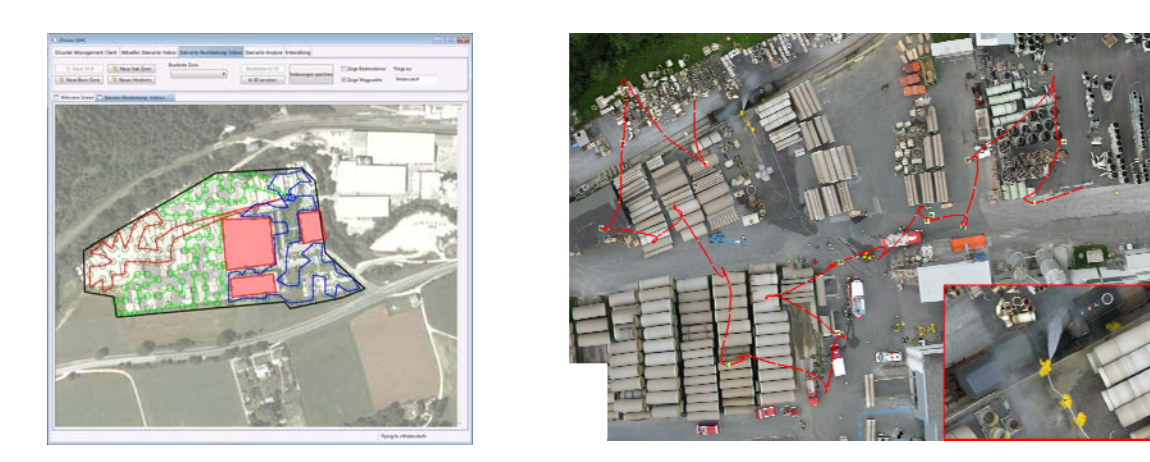
Figure 2. Observation area, forbidden areas, Proceedings of tands <sup>th</sup> Jameentiontat ISCRAM Conference – Lisbon, Portugal, May 2011

First of all, the operator had to specify the scenario. Figure 2 illustrates the scenario of the firefighter service drill in Wietersdorf. We specified the whole area of the exercise as the observation area, so that the officers in charge could monitor the movements of the firefighters. The buildings in the area were marked as obstacles because those were not of interest in this case. Specifying the scenario with the observation area, forbidden areas, allowed altitudes, and available resources took less than 2 minutes.