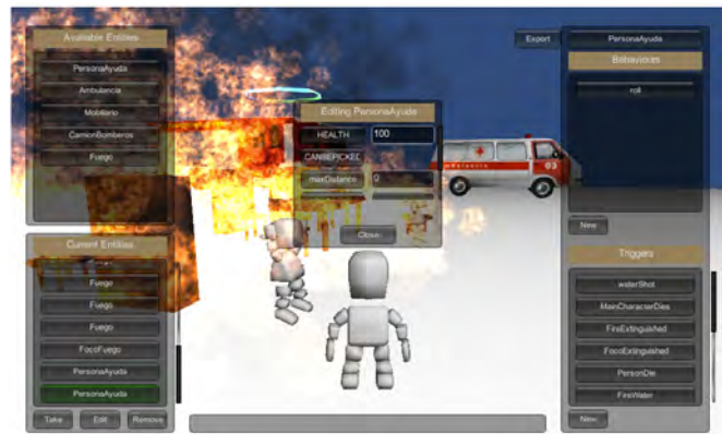
Figure 1. Screenshot of the GRE Simulations Authoring Tool

Test the simulation: At any given moment the trainer can take control of the game entities, changing their positions and triggering their actions. This allows rapid checking of whether the events defined are activated according to what it is expected and, therefore, if the simulation is correctly defined.