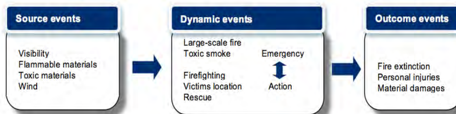
Figure 2. – Set of events considered in the simulation “Rescue and Fire Extinction Operation”

As a preliminary evaluation of the presented approach we designed and developed a 3D virtual environment for supporting training in rescue and fire extinction operations. On the one hand, we designed a game in which the player should rescue people from a fire while trying to extinguish it without harm from the fire and smoke. On the other hand we designed a simulation to support the analysis of the possible impact of toxic or inflammable materials or strong wind on the operational procedures (Figure 2). These source events could impact on the probability of occurrence of the dynamic and/or outcome events.